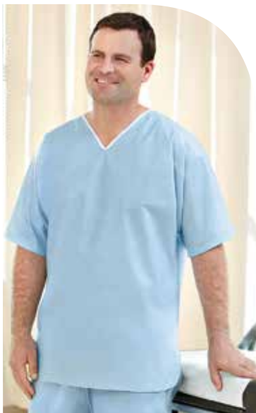
Light Blue Nonwoven Scrubs

Ideal for trauma patients, psychiatric patients, patient visitors and patients needing additional coverage during exams or diagnostic testing.