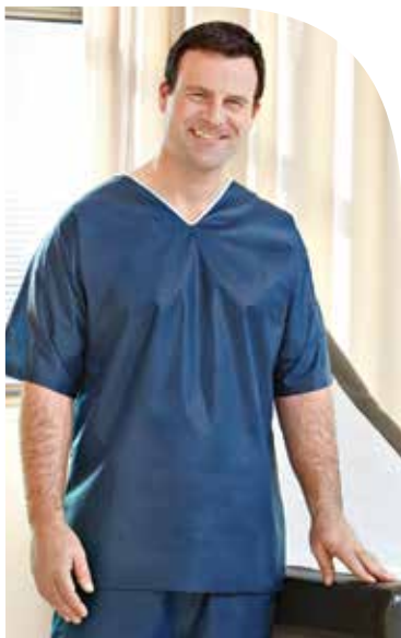
Navy Blue Nonwoven Scrubs