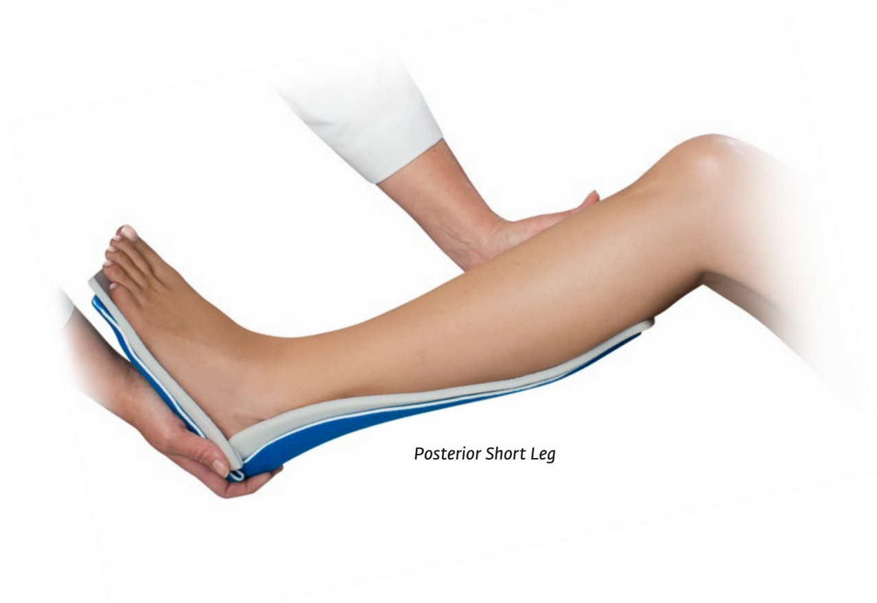
Posterior Short Leg

Wrinkle-free molding for a smooth interface, better fit and less skin pressure