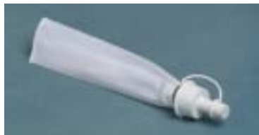
Large-Port Specimen Sock

Used to convert pour/accessory port into a male port specimen retainer. Accepts up to \frac{3}{8} " I.D. tubing with male port. Length 4 \frac{1}{2} ".