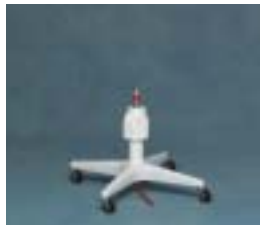
Short with Regulator Mount