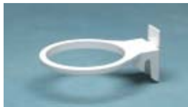
Guardian Close-to-Wall Ring Bracket