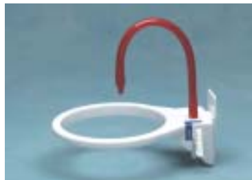
Guardian Ring Bracket with Built-in On/Off Valve