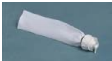
Female Specimen Sock

Used to convert pour/accessory port into a male port specimen retainer. Accepts \frac{3}{8} " to \frac{1}{2} " I.D. tubing with male port. Length 9".