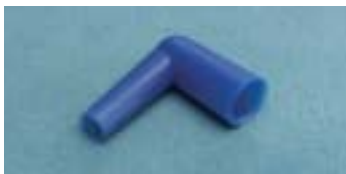
Right-Angle Adapter for Flex Advantage Port and CRD and Guardian Ortho Ports

Used to connect patient tubing to CRD and Guardian patient ports at a 90° angle. 50 per case.