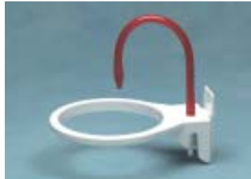
Guardian Ring Bracket

Brackets slide into a wall plate or roll stand. 1 each.