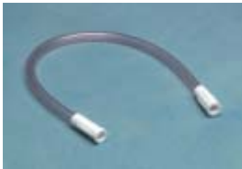
CRD™ and Guardian™ Tandem Tube

Used to connect vacuum source to canisters and manifolds. 8mm I.D. 100' roll per box; 4 boxes per case.