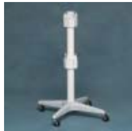
Tall Eight-Canister Dual-Head Roll Stand

Not compatible with 3000cc Flex Advantage canisters.