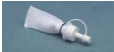
Short Specimen Sock Without Stick

Used to convert pour/accessory port into a male port specimen retainer. Accepts up to \frac{3}{8} " I.D. tubing with male port. Length 4 \frac{1}{2} ".