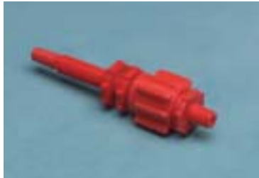
Universal Female D.I.S.S.

Allow use with standard vacuum regulator Diameter Index Safety System (D.I.S.S.) connections.