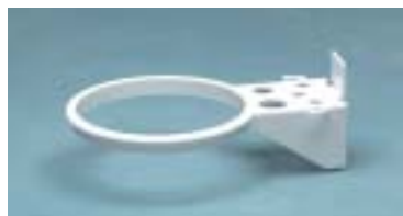
Guardian Ring Bracket Extended for Regulator