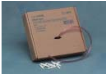
Bulk Connecting Tubing

Flexible, connecting tubing to adapt system for various setups.