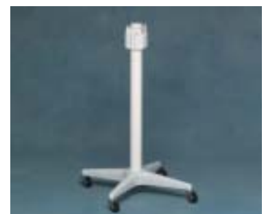
Roll Stand, Tall 65652-586