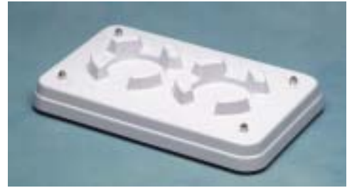
Double-Canister Roll Stand