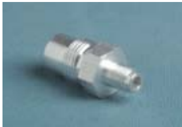
Male D.I.S.S. (Metal)

Used to support a regulator on a ring bracket or roll stand or to suspend a regulator ring bracket from a regulator. \frac{1}{8} " national pipe thread plastic adapter. 1 each.