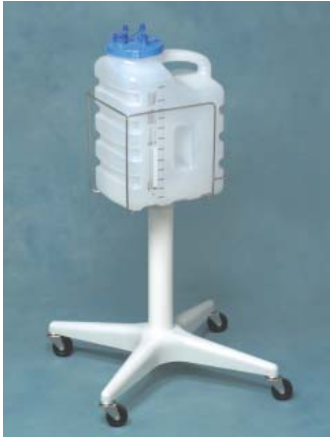
Canister and 18" roll stand