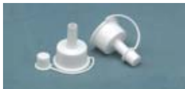
Pour/Accessory Port Convertor

Used to convert the pour/accessory port into a female port specimen retainer which will accept tubing sets with preattached hard plastic (or metal) male end fittings. Length 9".