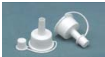
Pour/Accessory Port Convertor/Large

Used to convert the pour/accessory port into an additional patient port. Accepts up to \frac{3}{8} " I.D. tubing with male port.