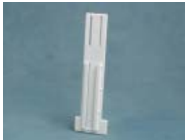
Variable Height Adapter

Used to attach ring brackets to a vertical surface. Predrilled with four \frac{1}{4} " holes. 1 each.