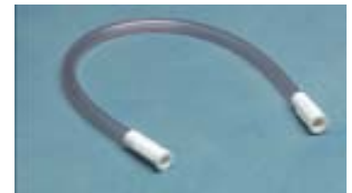
Tandem Tube 65652-542A