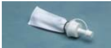
Short Specimen Sock

Used to convert pour/accessory port into a male port specimen retainer. Accepts up to \frac{3}{8} " I.D. tubing with male port. Length 9".