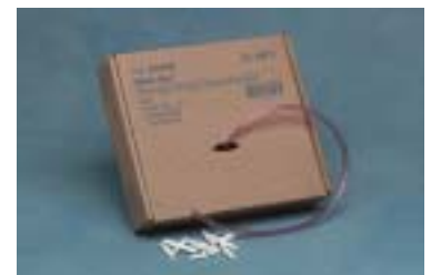
Bulk Tubing 516500