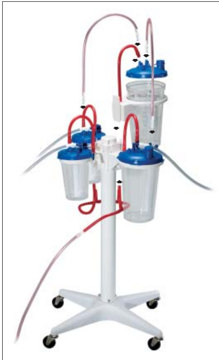
Multiple Guardian Canister Assembly

This is a multiple Guardian™ canister setup with two suction sites available. It has been arranged with two 1200cc Guardian canisters in tandem and two 3000cc Guardian canisters for 8400cc total collection capacity. Other configurations are available to meet your specific suctioning requirements.