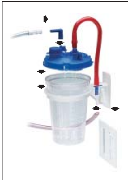
Wall-Mount Single-Canister Assembly

The Guardian™ system is available in several assembly options, allowing for flexibility at the point of use.