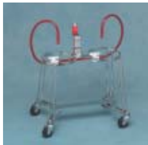
Metal Roll Stand with Regulator Hardware, Double