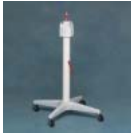
Tall with Regulator Mount