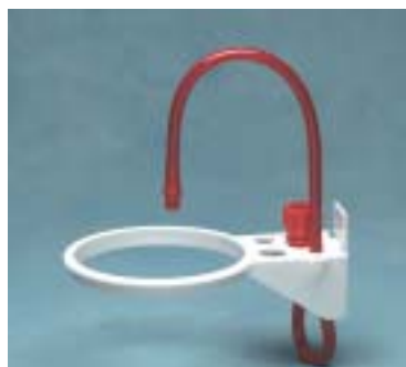
Guardian Ring Bracket Extended for Regulator (with D.I.S.S. and Hose Assembly)