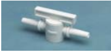
In-Line Vacuum On/Off Valve

Used to turn vacuum supply on and off as well as regulate the flow of the vacuum supply to the canister.