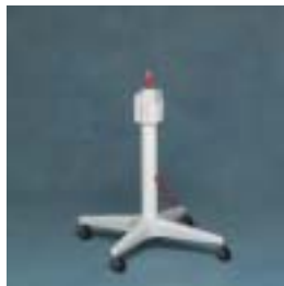
Medium with Regulator Mount