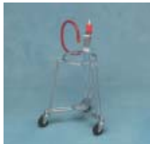
Metal Roll Stand with Regulator Hardware, Single

Additional roll stands for Guardian canisters. 1 each.