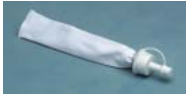
Standard Specimen Sock

Used to collect and retain specimens for analysis. 10 per case.