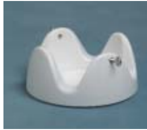
Single-Canister Base Stand