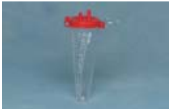
Universal Critical Measure