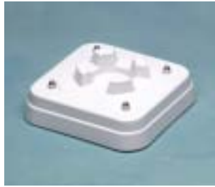
Single-Canister Roll Stand