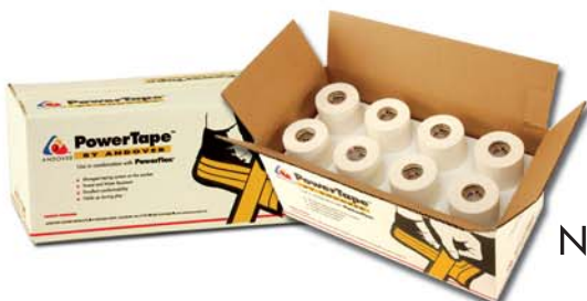
2" or 1.5" PowerFlex and 1.5" & 1" PowerTape or VictoryTape. (Figure 2.4 - 2.6)

NEW. INNOVATIVE. DIFFERENT. 2 - PATENTS PENDING