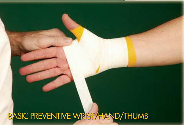
BASIC PREVENTIVE WRIST/HAND/THUMB