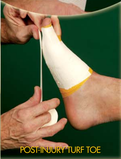
POST-INJURY TURF TOE