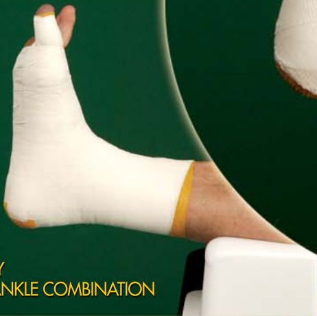
POST-INJURY TURF TOE/ANKLE COMBINATION