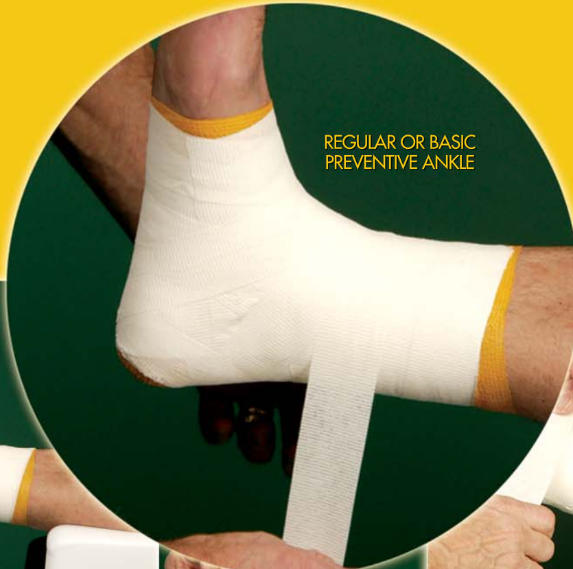
REGULAR OR BASIC PREVENTIVE ANKLE