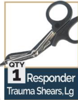
QTY 1 Responder Trauma Shears, Lg