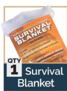
QTY 1 Survival Blanket

Contents of ADVANCED BCD Individual Bleeding Control Kit