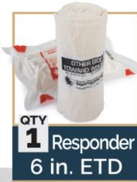
QTY 1 Responder 6 in. ETD