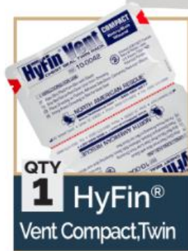
QTY 1 HyFin® Vent Compact, Twin