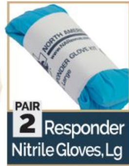
PAIR 2 Responder Nitrile Gloves, Lg