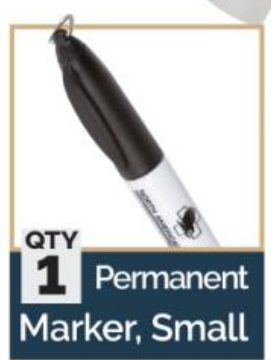
QTY 1 Permanent Marker, Small