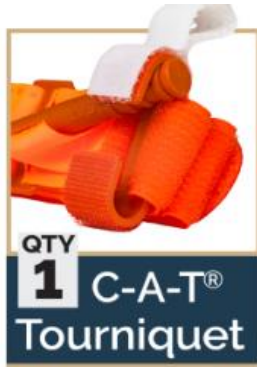
QTY 1 C-A-T® Tourniquet