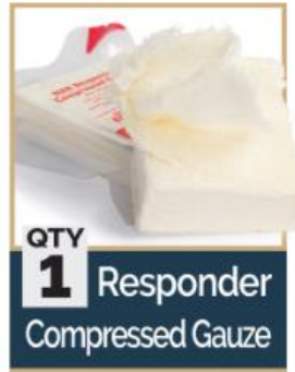
QTY 1 Responder Compressed Gauze