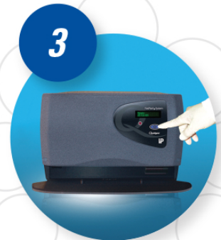
Press the START button