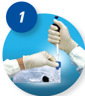
Dispense sample into the FastPack® Injection Port