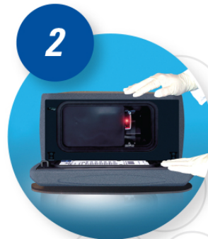
Place FastPack® into the FastPack® IP Instrument