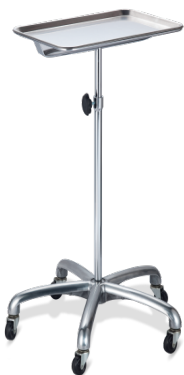
Mayo Stand Item Number: 570-1485