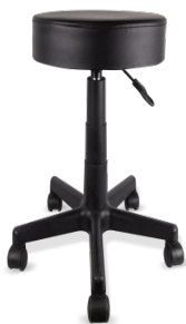
Exam Stool Item Number: 570-1487