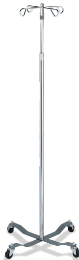
Chrome IV Pole w/ 4 hooks Item Number: 570-1486