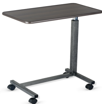
Overbed Table Item Number: 570-1488