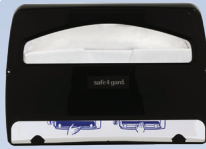
Safe-T-Gard® 1/2 Fold Seatcover Dispenser Black, #57748

Hygienic solutions that help reduce product replacement intervals and minimize run-out situations so you can spend more time on what matters most, your patients.