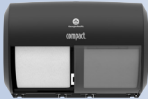
Compact® High-Capacity 2-Roll Side-by- Side Coreless Toilet Paper Dispenser, Black, #56784A