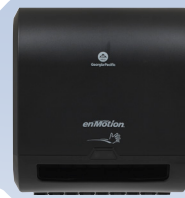
enMotion® Impulse® 8" 1-Roll Automated Touchless Paper Towel Dispenser Black, #59498A