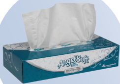
Angel Soft Ultra Professional Series® Flat Facial Tissue #48560

Help keep your hands and equipment clean with our hygiene enhancing products.