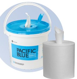
Pacific Blue Select Surface System Bucket and Refill, #54006 & #29700