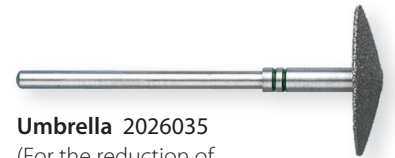
Umbrella 2026035 (For the reduction of hyperkeratoses, tylomas and heel callus.)