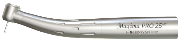
Maxima PRO 2SAR™ Non-Optic Item No: (570-2095)

Active sealing system prevents suck-back of fluid and particles to reduce risk of cross-contamination of air and water lines.