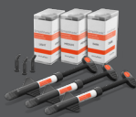
SimpliShade™ Universal Composite

Get DOUBLE loyalty reward points on these featured products: