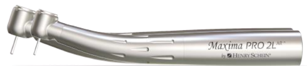
Maxima PRO 2LAR™ Optic (570-2094) Maxima PRO 2SAR™ Non-Optic (570-2095)

Maxima PRO 2AR™ High-Speed Air-Driven Handpieces Specifically engineered for aerosol reduction and anti-retraction.