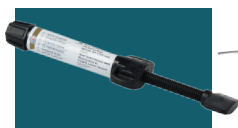
Maxima® Natural Elegance® Packable Bulk Fill