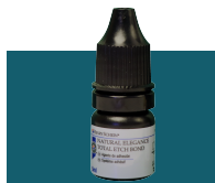
Natural Elegance® Total Etch Bond