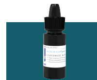
Natural Elegance® Universal Bond

For our HENRY SCHEIN BRAND PRODUCTS CATALOG , as well as additional product information, visit WWW.HENRYSCHEINDENTAL.COM/HSBRAND .