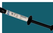
Natural Elegance® Premium Flow Nano Composite