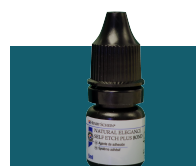
Natural Elegance® Self Etch Plus Bond