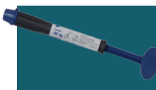
Natural Elegance® Premium Composite