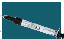
Natural Elegance® Flowable Bulk Fill