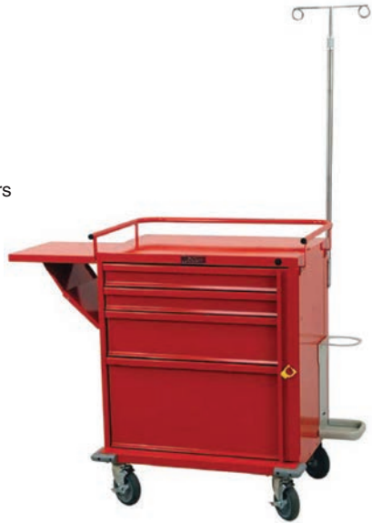
#V24-4B-HSACC, Crash Cart (738-0008) .....ea