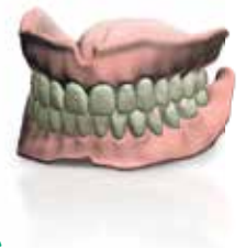
NEW! Dental System 2919 3Shape