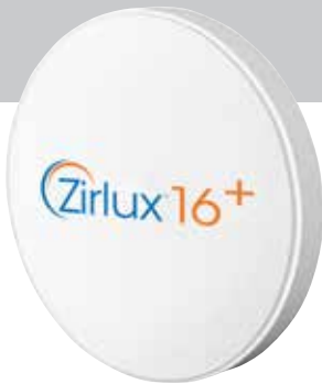
Zirlux 16+ Zirlux

Offers Valid November 4–December 27, 2019